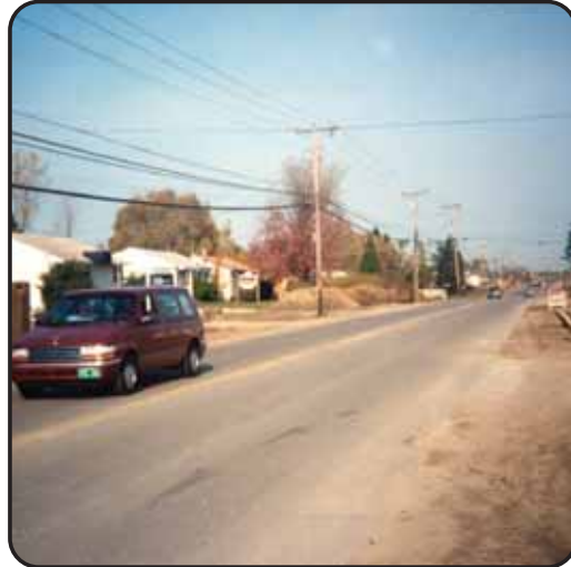
DORSET ST. BEFORE ACCESS MANAGEMENT