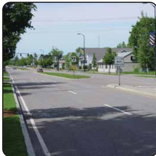
DORSET ST. AFTER ACCESS MANAGEMENT

"There is widespread acknowledgment by participants that they tend to avoid businesses that do not have safe and convenient access."