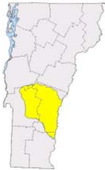
Figure 6-1: Proposed Projects on US 4 and VT 103